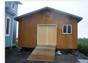
Photo: Completed building