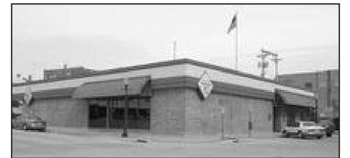
New home of Decorah Covenant Church

In October 2008, the congregation voted to proceed with the renovation. Work began February 2009 and should be completed by the printing of this newsletter with plans to worship in the facility for the first time in June, followed by a dedication service and open house on July 12, 2009. Members continue to pray for God's guidance to use them and this building to His Glory.