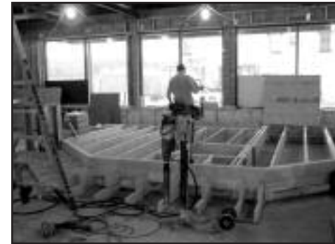
Building the worship platform

December 1998; moving in 1999 to the gym at St. Benedict's School where they are still worshipping 10 years later. On May 14, 2000, they became a chartered church with The Evangelical Covenant Church.