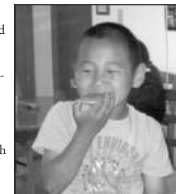
PB&J after-school snack