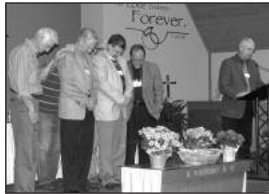
Prayer for Conference Superintendents

• A special offering of $1,103 was received for the Mountain Village, Alaska Partnership. Another offering of $1,192 was received during the Friday worship for the ministers' crisis fund. • Delegates approved a budget of $813,793 for 2010. • Churches will receive stories from the annual meeting on DVD late this summer.